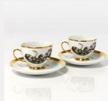
TANER CEYLAN SNAKE COFFEE CUPS