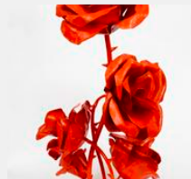
WILL RYMAN SMALL ICON ROSE