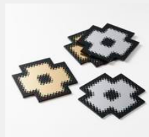
SHINJI MURAKAMI GOLD/SILVER FLOWERS MIRRORED COASTERS

Follow us on Facebook. Sign up for our mailing list.